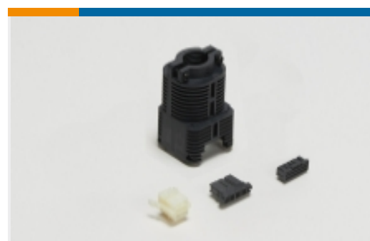
Rectangular Connector Housings(17)