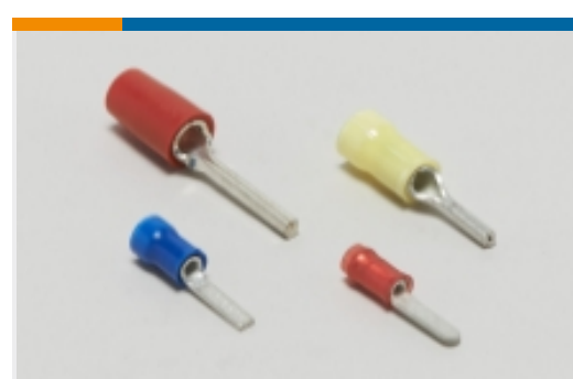
Crimp Wire Pins, Tabs &amp; Ferrules(3)