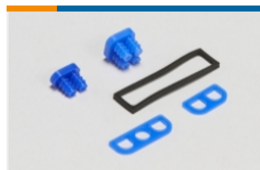
Rectangular Connector Seals(1)